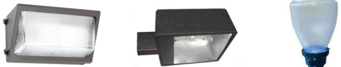
Wall Pack Shoe Box Post Top